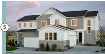
5 Tri Pointe Homes: Wild Oak Paired • 2-Story Plans from the mid $600s-$800s | 720-513-9836