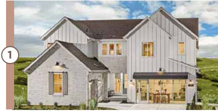
1 Shea Homes: The Luxe Collection Ranch • 2-Story • Main Floor Primary Plan Multi-Gen Plan from the $1 millions | 303-346-4120

Choose from a range of floorplans, including paired one-stories, spacious two-stories and luxury residences.