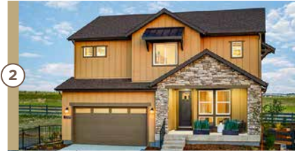
2 Shea Homes: The Gallery Collection Ranch • 2-Story Plans from the $800s-$900s | 303-346-4110