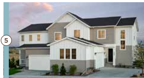
Shea Homes: The Reserve Collection Ranch Plans from the $800s | 303-346-4115