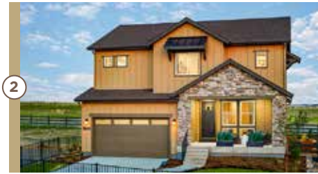
Shea Homes: The Luxe Collection Ranch • 2-Story • Main Floor Primary Plan Multi-Gen Plan from the $1 millions | 303-346-4120