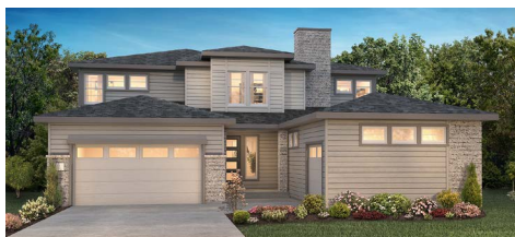
SHEA HOMES 866-696-7432 | LUXE COLLECTION 7158 Copper Sky Circle $979,000 | 3,923 sq. ft. | 5 Bed | 5.5 Bath Available July/Aug 2020 | View Home Here >