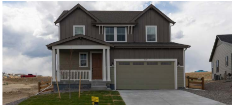
KB HOME 303-323-1211 | CLASSIC COLLECTION 1678 Stable View Drive $586,000 | 2,572 sq. ft. | 4 Bed | 2.5 Bath Available now | View Home Here >