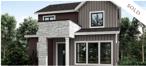
BERKELEY HOMES 303-223-8399 6187 Saddlesmith St. $615,982 | 1,894 sq. ft. | 3 Bed + Study | 2.5 Bath