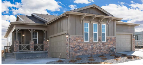
KB HOME 303-323-1211 | VIEW COLLECTION 2012 Sagerock Dr. $525,000 | 1,738 sq. ft. | 3 Bed | 2 Bath Available now | View Home Here >