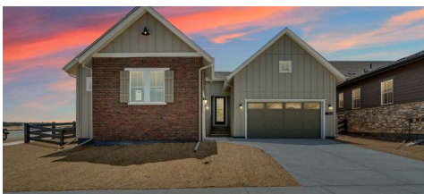
SHEA HOMES 866-696-7432 | RETREAT COLLECTION 7125 Bellcove Trail $834,900 | 4,039 sq. ft. | 4 Bed | 3.5 Bath Available Now | View Home Here >