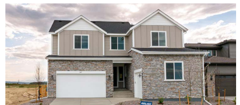
TRI POINTE HOMES 720-513-9836 | SOLIS 6467 Saddlesmith St. $829,900 | 5,033 sq. ft. | 5 Bed | 4.5 Bath Available Now | View Home Here >