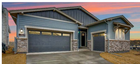
SHEA HOMES 866-696-7432 | RETREAT COLLECTION 7124 Bellcove Trail $819,900 | 2,927 sq. ft. | 3 Bed | 3.5 Bath Available now | View Home Here >