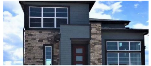
BERKELEY HOMES 303-223-8399 6193 Saddlesmith St. $592,406 | 1,818 sq. ft. | 3 Bed | 2.5 Bath Available now | View Home Here >