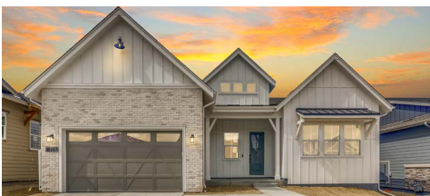
SHEA HOMES 866-696-7432 | RETREAT COLLECTION 7132 Bellcove Trail $809,900 | 2,729 sq. ft. | 2 Bed | 2.5 Bath Available now | View Home Here >