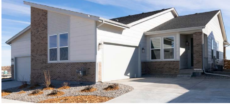
KB HOME 303-323-1211 | VIEW COLLECTION 2020 Sagerock Dr. $522,000 | 1,789 sq. ft. | 2 Bed | 2.5 Bath Available now | View Home Here >