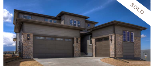
TRI POINTE HOMES 720-513-9836 | SOLIS 6485 Saddlesmith St. $801,695 | 4,214 sq. ft. | 5 Bed | 5.5 Bath