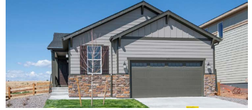
KB HOME 303-323-1211 | CLASSIC COLLECTION 1674 Stable View Drive $559,000 | 1,902 sq. ft. | 3 Bed | 2 Bath Available now | View Home Here >