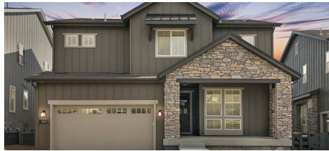
SHEA HOMES 866-696-7432 | GALLERY COLLECTION 6643 Barnstead Drive $669,900 | 2,931 sq. ft. | 5 Bed | 4 Bath Available now | View Home Here >