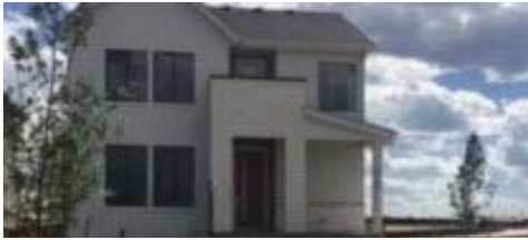
BERKELEY HOMES 303-223-8399 6199 Saddlesmith St. $582,500 | 1,674 sq. ft. | 3 Bed | 2.5 Bath Available now | View Home Here >